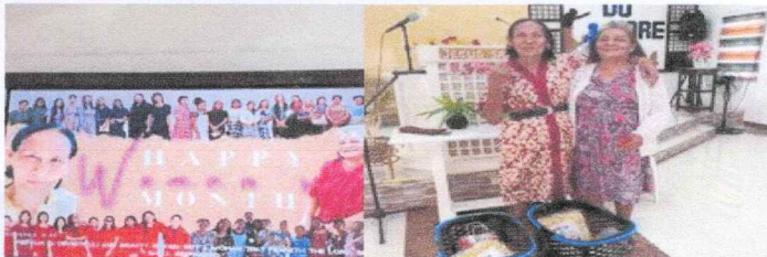
Celebrating Women's Month and honoring widows in our church...Happy Women's Month to all women!