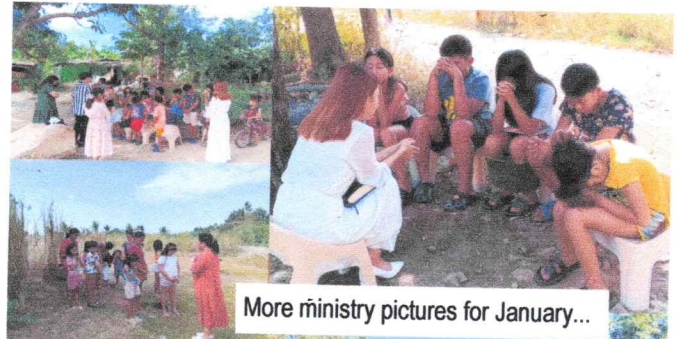
More ministry pictures for January...

In celebration of the Bible month, we were able to give some Bibles to new kids and juniors in our church. They are fruits of our weekly children village centers .