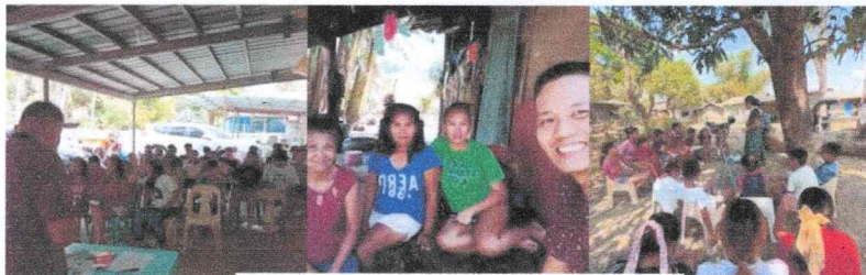
More ministry pictures for March...