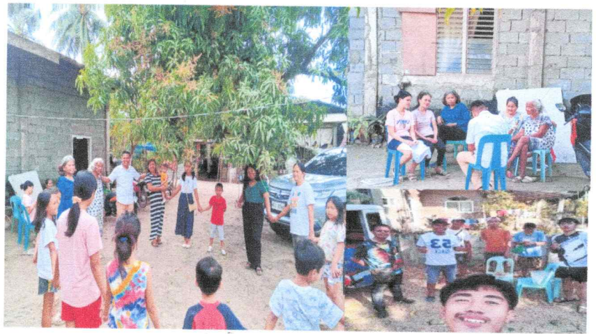
Praise God for newly opened children centers...

CALONGBUYAN OUTREACH... This was the place where we were supposed to build a worship place in 2020 but was hindered. The land owner met with us again in February of this year and has finally decided to entrust us the constructing of the worship place. We have started filling it with dirt because it's a flooded area and as soon as we have workers available, we'll start the construction. Please help us pray that the ministry here will become fruitful. We're praying to reach the relatives of the landowner, who used to be our schoolmate at the Bible college.