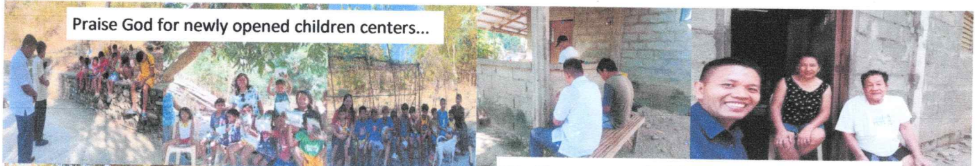
Weekly centers and Bible studies in February...