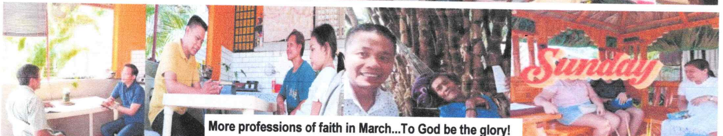
More professions of faith in March...To God be the glory!