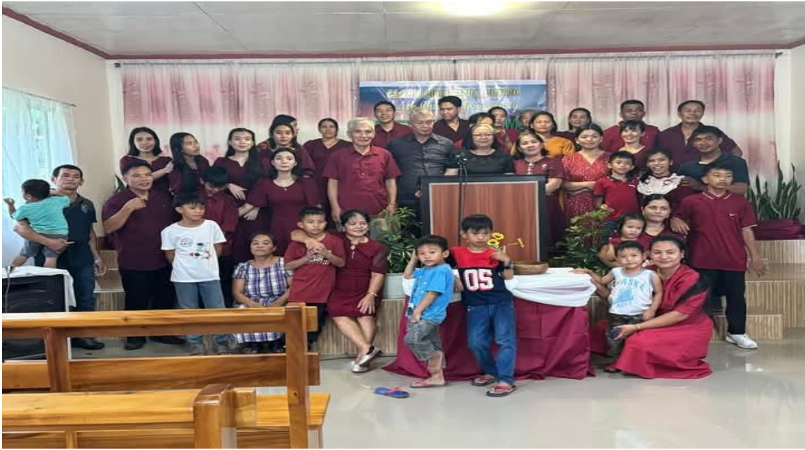
Some of the Bagulin Bible Baptist Church Members together with our Guest Speaker and his wife.