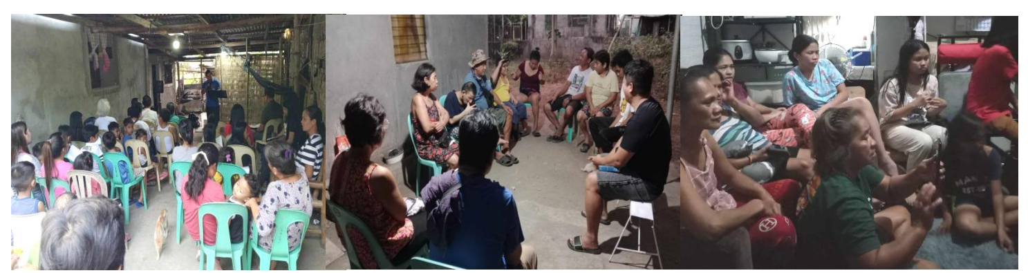
Week Days Family small group in Villages, Discipling them to reach their neighborhood